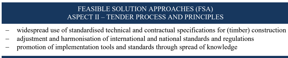
Figure 6. FSA in tender process in timber construction

Ultimately, this step towards standardised tendering in timber construction also forms the basis for a continuous compliance with the previously cost framework that lasts until the project is completed and does not result in a contractual framework far from reality – which is often recognizable in modern construction industry. Although extensive use of standardised specifications for building construction requires a trial period of familiarization for the contracting authorities it also offers the certainty of ensuring unambiguous comparability of all offers and reduces the contract risk by eliminating inadequate formulations and contradictions in the tender. In the end, this also effects the price of the bidder, because the contractor also experiences a minimization of the contract risk as a result of a standardised call for tender, which becomes part of the construction contract.