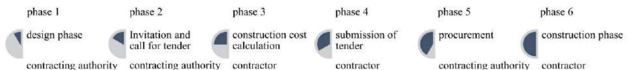
Figure 4. Six stages of the tender process in the design-bid-build project delivery method

In accordance with the fundamental principle "a good project requires a good tender" the question occurs how to translate a sound design into a complete tender dossier to provide the best possible basis for a contractual framework which prevents cost overruns, construction time extensions and legal disputes. The underlying tendering process plays an essential role in achieving a smooth transition from design to construction in the traditional design-bid-build project delivery method (figure 4) and helps to avoid the previously mentioned undesired monetary, temporal and legal impacts on the overall project.